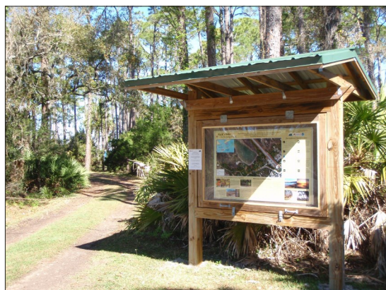
Kiosk at the kayak and camp area entrance.

Nick's Hole consists of about one mile of bayshore and 40+ acres of pine flatwoods, coastal hammock, rosemary-oak scrub and tidal marsh. The property offers a variety of recreational opportunities including kayaking, fishing, hiking, primitive camping, picnicking and wildlife viewing.