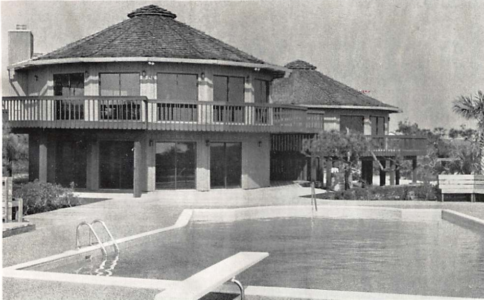
Beach Club complex and swimming pool.