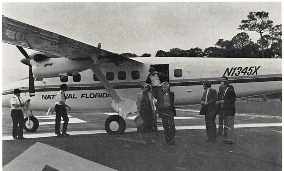
Passengers disembark from the first plane that landed on the new airstrip.

Anyone who wishes to fly in to the new airport should call Plantation Realty at (904) 670-2521 to arrange shuttle transportation.