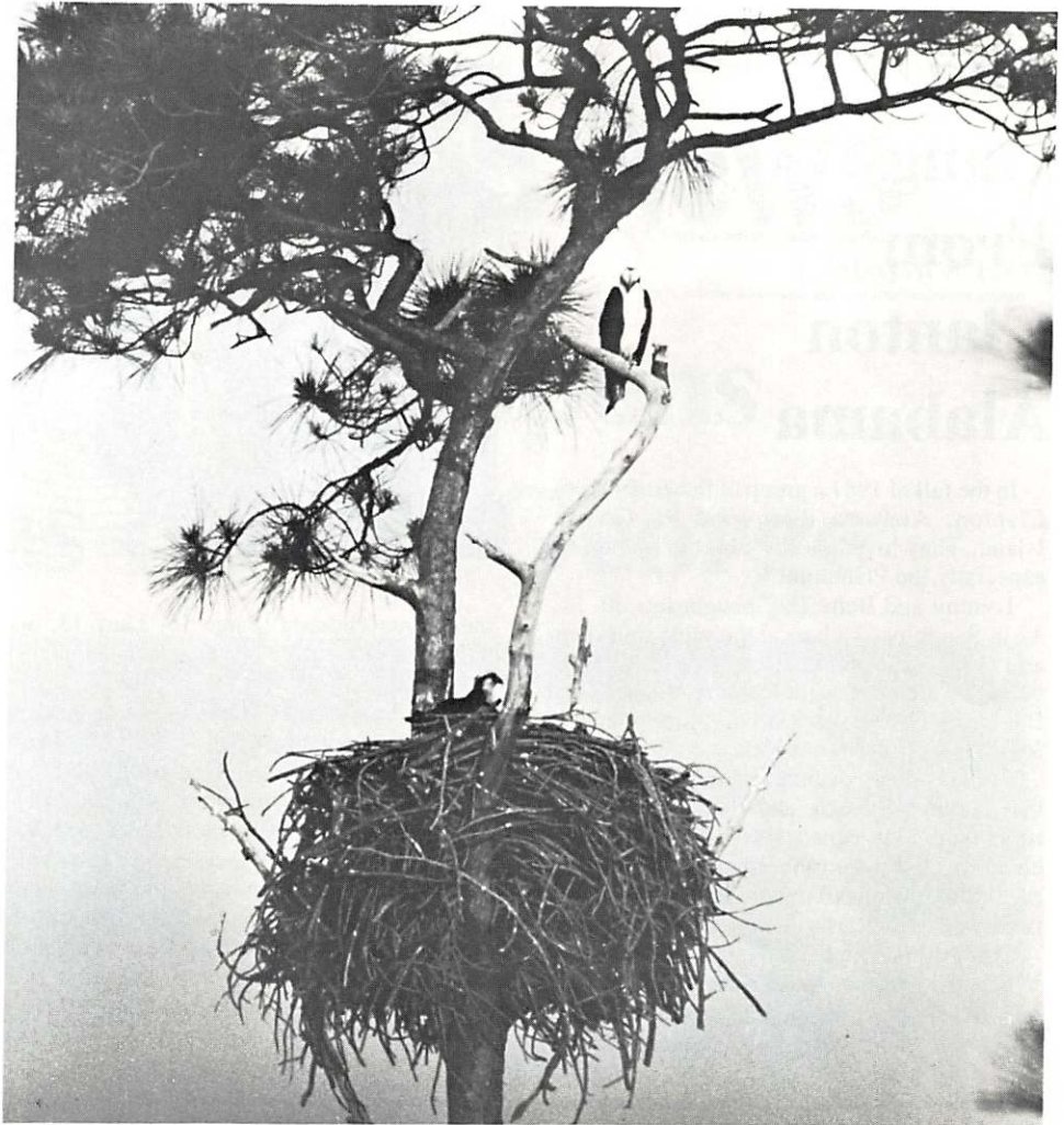
An osprey guards its nest in the Plantation.

For more information, contact Plantation Realty (904) 670-2521.