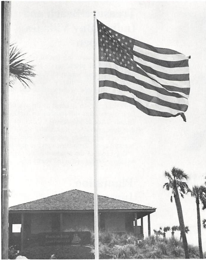
The big American flag waves daily at the Plantation Realty offices.