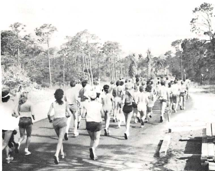
Runners race down Magnolia to start the Plantation Run.

Following the race, a covered dish lunch was held at the Clubhouse. Leisure Properties donated T-shirts to all entries finishing the race.