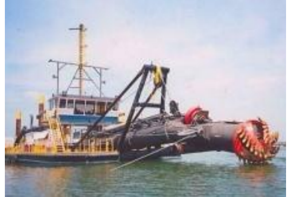
The dredge Integrity