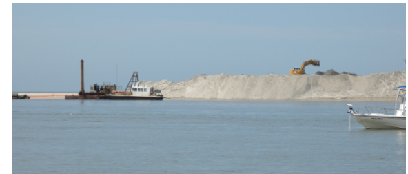
dredge spoils 4/22