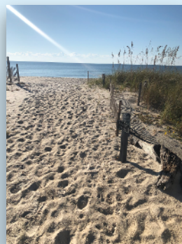
Denise West ~ Before