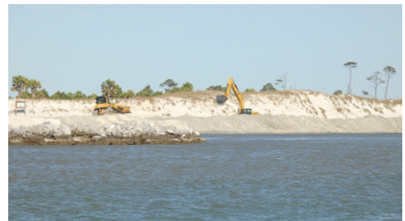
building up the LSGI side of Sikes Cut

see next page for an incredible photo of this beach and dune transformation