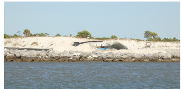
clay and mud being spread on LSGI 4/22