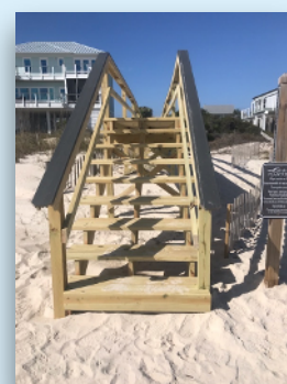
Denise West ~ After