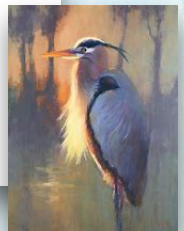
Exhibit opens February 13 M-F 8-4

Owners Wine & Cheese Reception February 11 4-6 Magnolia Road Clubhouse